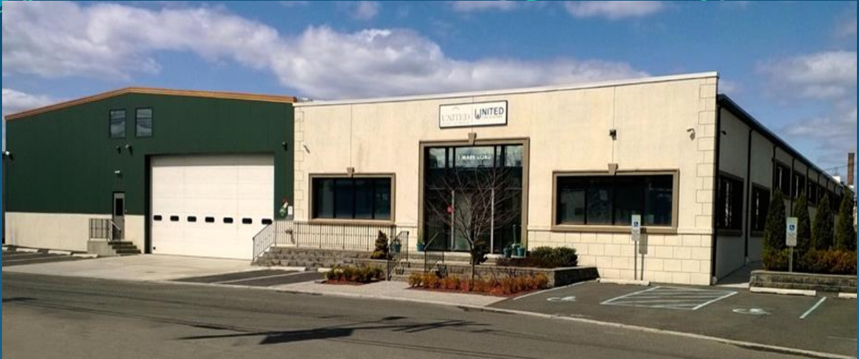
Headquarters of UNITED Fire Systems in Kenilworth, NJ

UNITED Fire Systems specializes in the manufacturing of innovative and effective fire protection equipment. Our parent company, UNITED Fire Protection Corporation, was founded in 1988 as a complete fire protection contractor. This experience enables us to be on the cutting edge of protection technology, and understand exactly what is required to design, engineer, and support the best products available today.