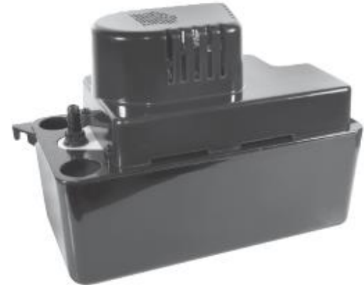
FIGURE 3 TYPICAL CONDENSATE PUMP

Local regulations may require the installation of an oil / water separator in condensate drain piping. Verify local requirements before completing installation.